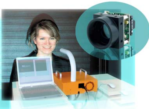
A 3D portrait inside a glass cube. The high-precision master is produced with a uEye USB camera

In this process a laser engraves a three-dimensional image into the inside of a solid glass cube. First a high-resolution 3D camera system, which is referred to as a face scanner, takes an image of the motif, e.g. a face. The scan is further processed with specially developed software and then transmitted to a laser system for internal engraving. The precisely dimensioned and focused energy of the laser creates tiny changes in the crystal structure of the glass.