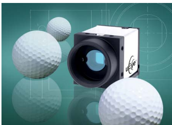
The uEye® cameras are barely larger than a golf ball and come in different versions, including board-level models

Vitro Laser GmbH was founded in late 1998, after extensive research into internal laser engraving. The company pioneered the process of internal laser engraving by developing its own hardware and software ready for series production. The first laser system was shipped in spring 1999. In 2004 Vitro Laser GmbH decided to self-produce the scanners "as the systems available in the market did not have a sufficiently high resolution," and started shipping the new scanners in January 2005. The VitroScan is similar to an overhead projector. Its base contains a projector that directs a stripe projection onto the face to be digitized. This allows creating a 3D image with only one high-resolution camera, which is located in the gooseneck and takes the image.